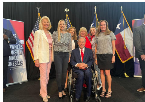
TWRW members in attendance to celebrate

I was happy to welcome the Governor to SD 4 and be part of this historic win for Texas taxpayers – making sure you keep more of your hard earned money.”